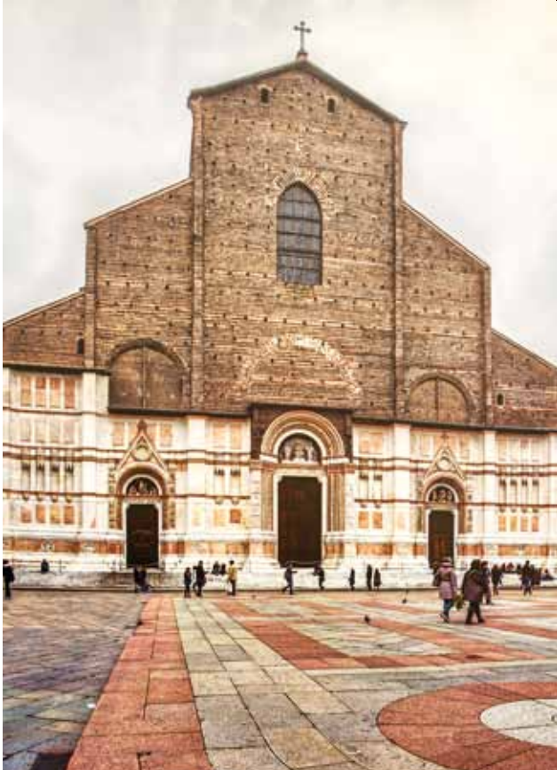
Basilica of San Petronio